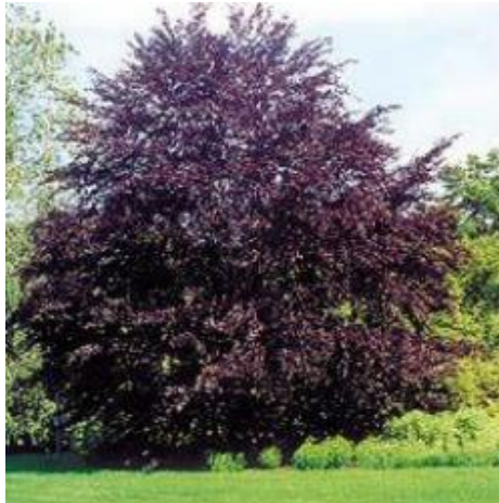
Typical Purple Beech in summer: